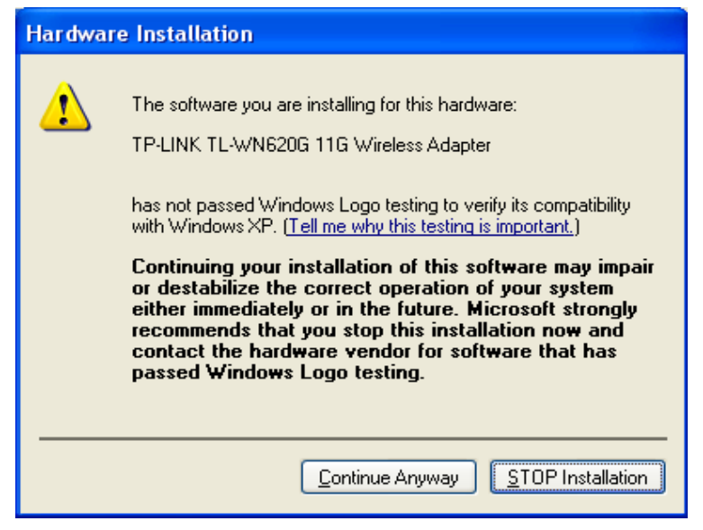
Figure 2-8a Windows XP warning box

select Continue Anyway to continue installation.